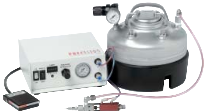
ST100 shown with optional 1 gallon tank and FC100 valve.

15 Solar Drive Halfmoon NY 12065 tel 518 371 2684 fx 518 371 2688 info@pva.net